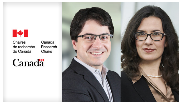
Researchers Win Prestigious Chairs /read more