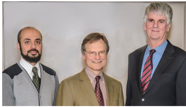
TRI Invention Helping Patients /read more